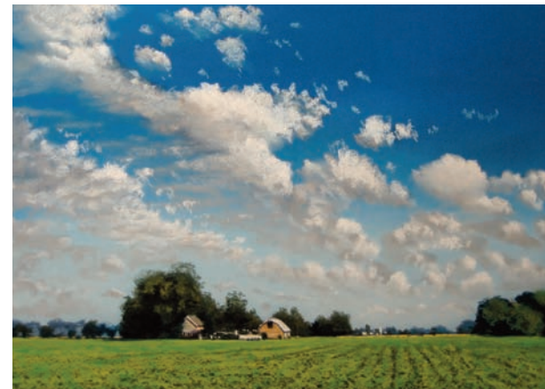
Joseph Sweeney, Farm on New Road , pastel