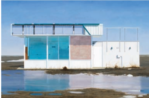
Erin Murray, Miesian Influence Loop , 2011 oil on MDF panel, 16 x 24 inches