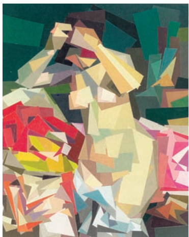
Ken Kewley, Bather Arranging Her Hair collage on paper, 7 3/4 x 5 3/4 inches