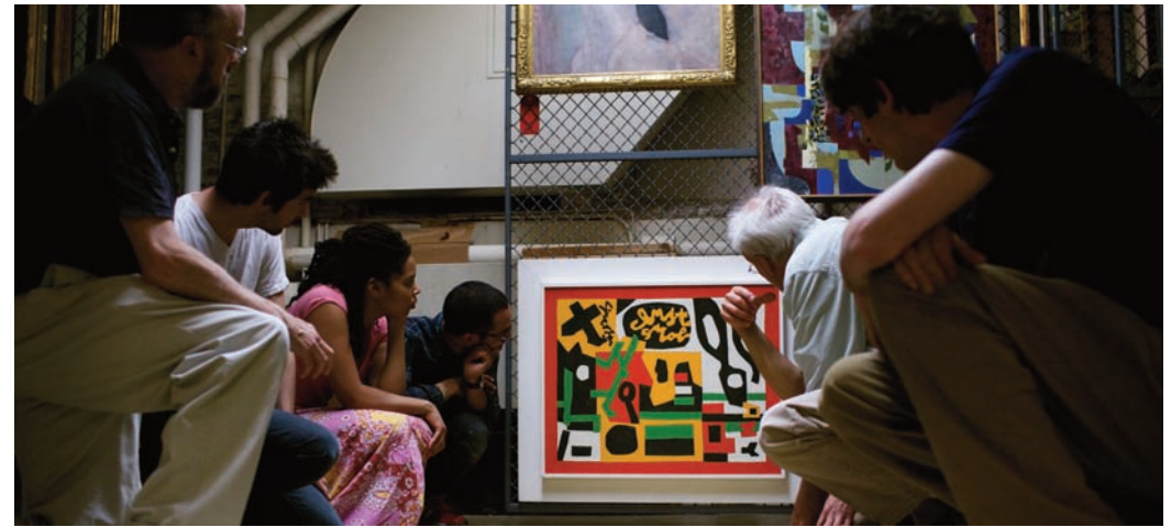
Art