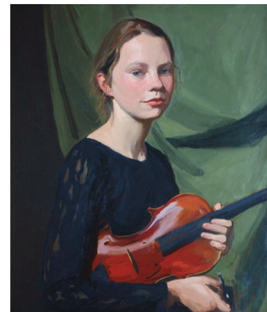
Paul DuSold, Olivia , oil on canvas, 26 x 22 inches