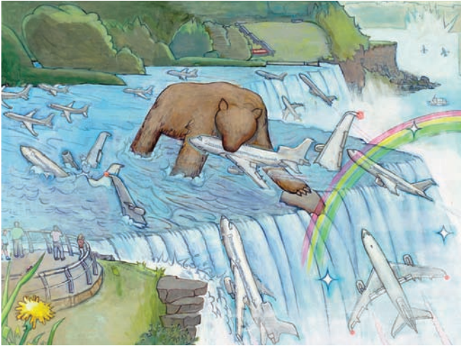
Hiro Sakaguchi, Bear Fishing , 2008 acrylic, oil on canvas, 30 x 40 inches